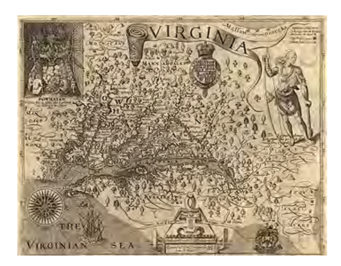
Map by John Smith 1609

Virginia Company of London. Court Book. Part A. April 28, 1619 - May 8, 1622.